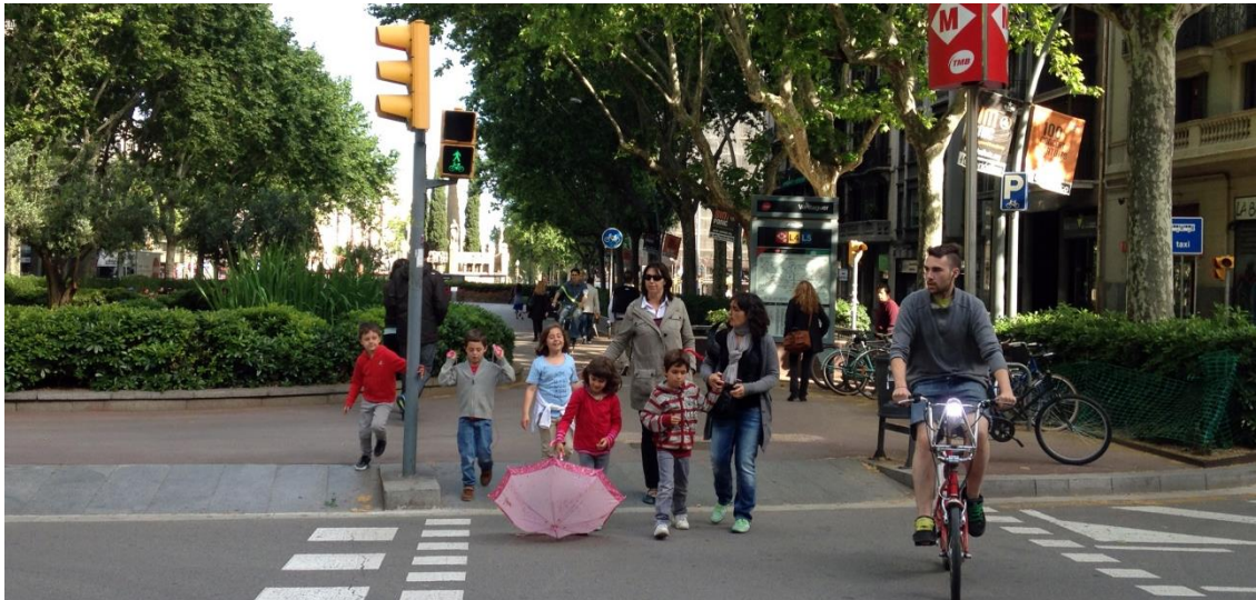
Towards Livable Cities- The Role of Urban Mobility Training course, Parallel to Habitat III Quito, October 20, 2016